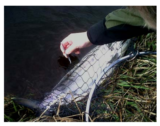
Examples of scales being removed from fish to be returned.